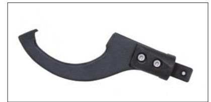
type C (optional)