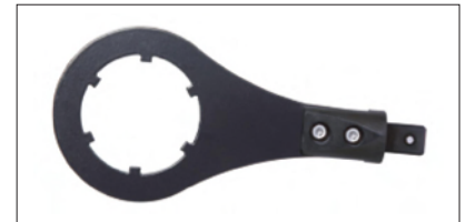
type O (optional)