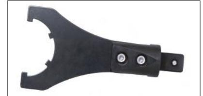
type UM (optional)