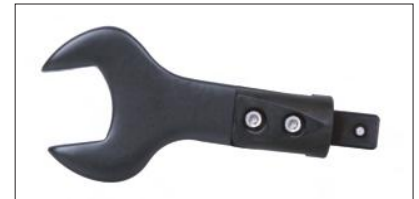
type A (optional)