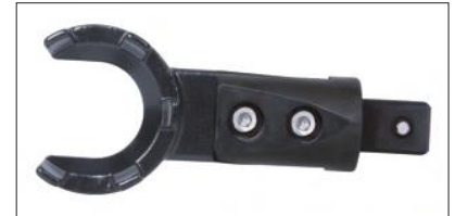
type M (optional)